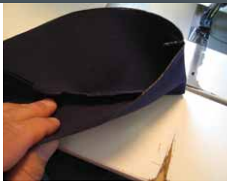
5 Round the corners and make relief cuts along the stitched edge of the visors, turn right side out and top-stitch three sides to finish.

folded extension of the pocket ends. A 1\frac{1}{2} -inch line is drawn as a guide for sewing in the zipper. Inset : Here is one of our visors cut 3\frac{1}{2} inches wide that will finish 2\frac{1}{2} inches wide. It is two-ply and stitched on three sides. A seam allowance of \frac{1}{2} inch has been added to the ends of each visor.