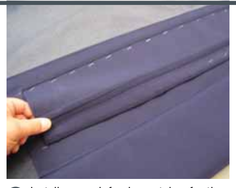
Install your reinforcing patches for the mid pockets and staple your mid pockets in place on the center of the patches. Be sure to ease off the mid pocket corners ¼ inch.