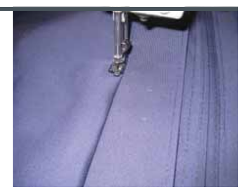
The forward and aft pockets being topstitched after seaming. Be sure your pockets and visors are facing out before top-stitching as shown in the photo. We staple all our hems to hold alignment of the pieces prior to seaming.