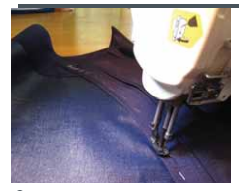
The forward and aft pockets are turned to the inside and stapled in place. The pocket is being stitched down on the binding stitch line in the photo.