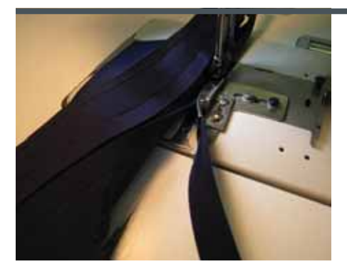
Turn your pockets over and cut down the middle of the two stitch lines and bind all pocket edges, except the forward and aft edges where they are going into a seam.