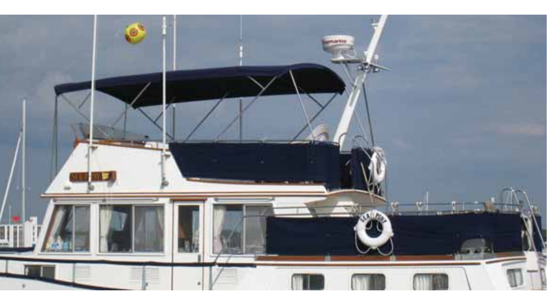
A 13-foot-long Hood bimini installed on a Trawler in Marblehead, Mass.